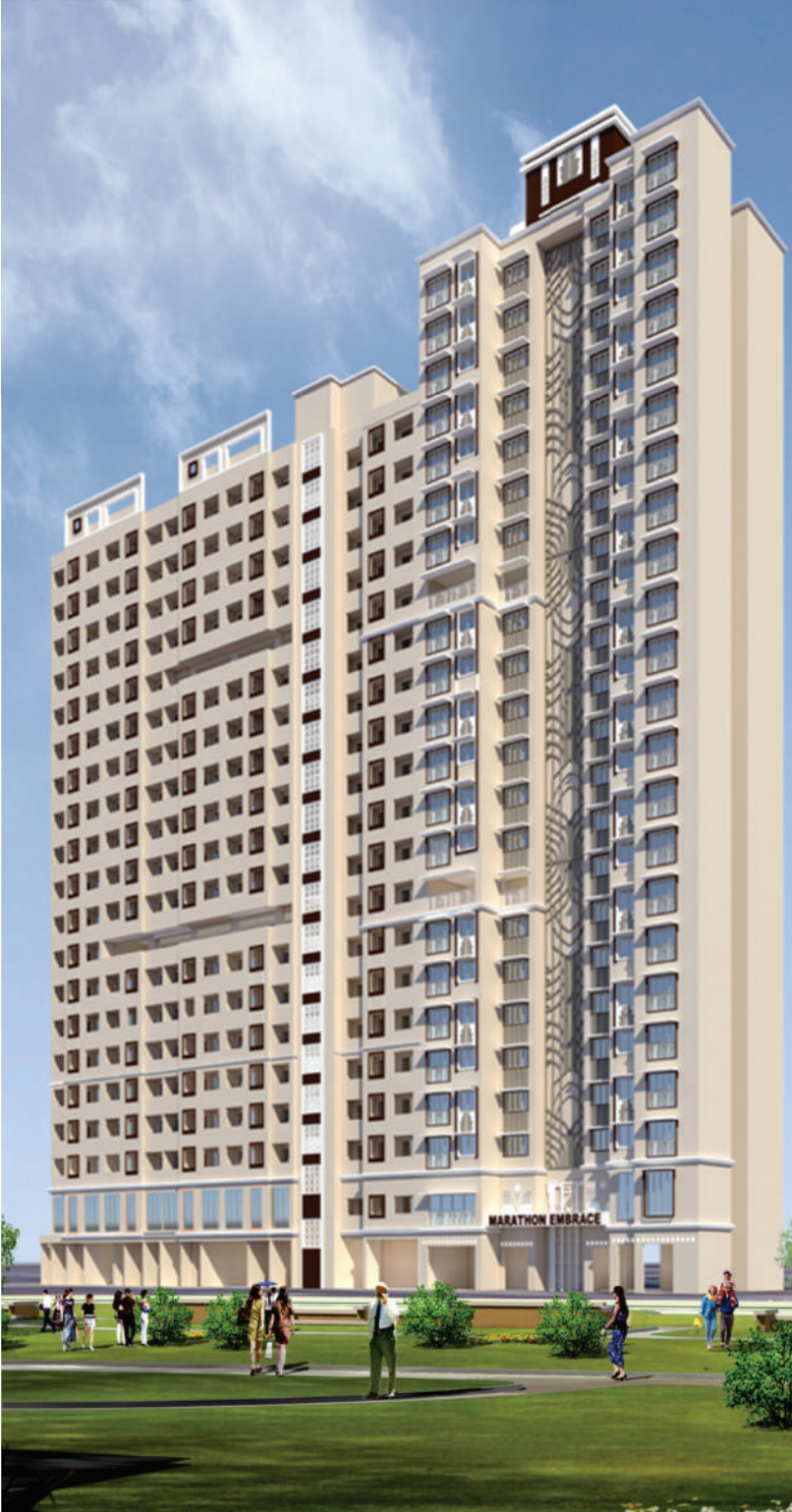
Construction Status | Rehab 19th Slab Completed