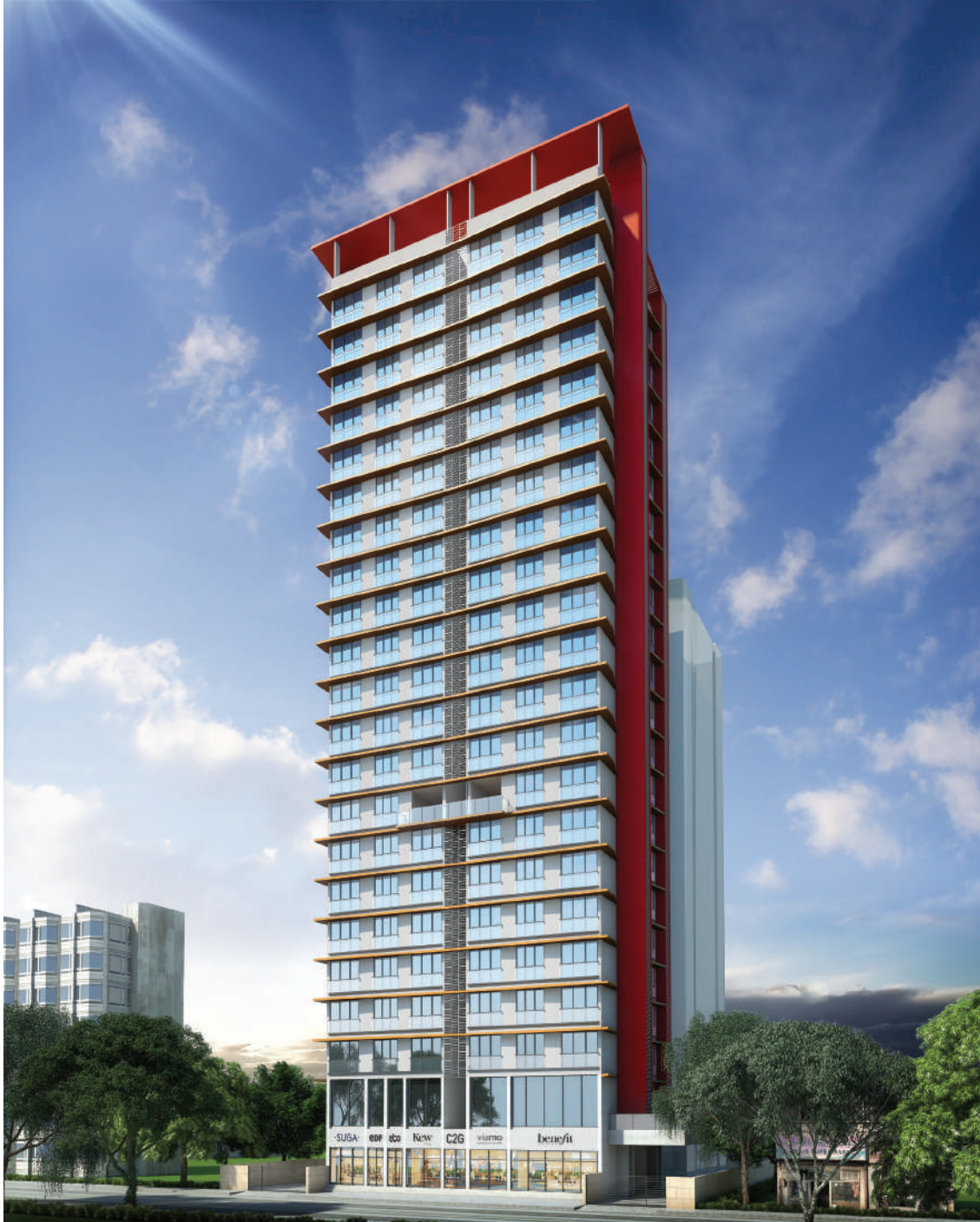
Artist's Impression - Elevation RERA No.: P51800016063