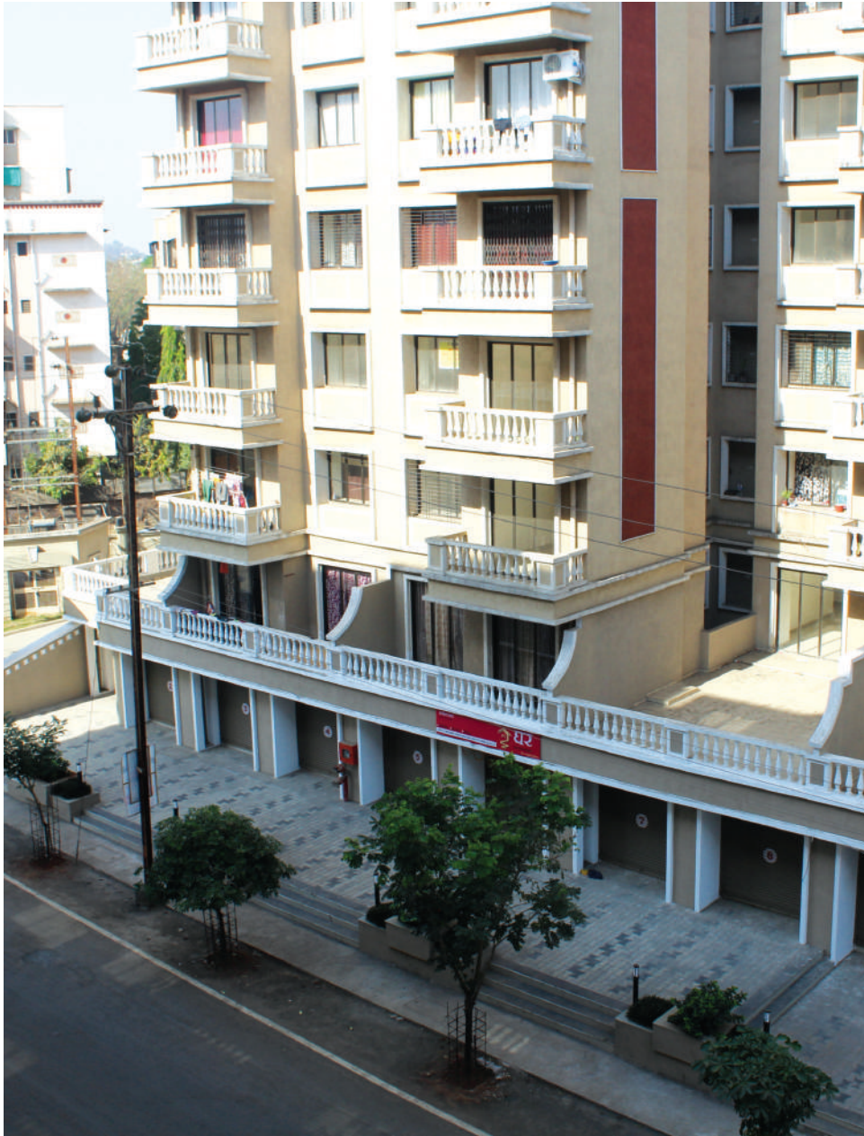
Actual Image - Site

RERA NO.: Marathon Nagari Nx Vigo D - P51700005045, Marathon Nagari Nx Vitoria D - P51700005049