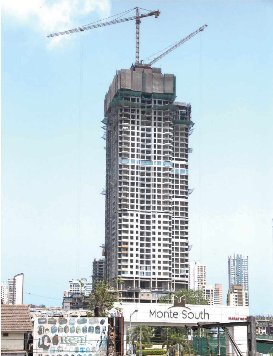
Actual Image - Site