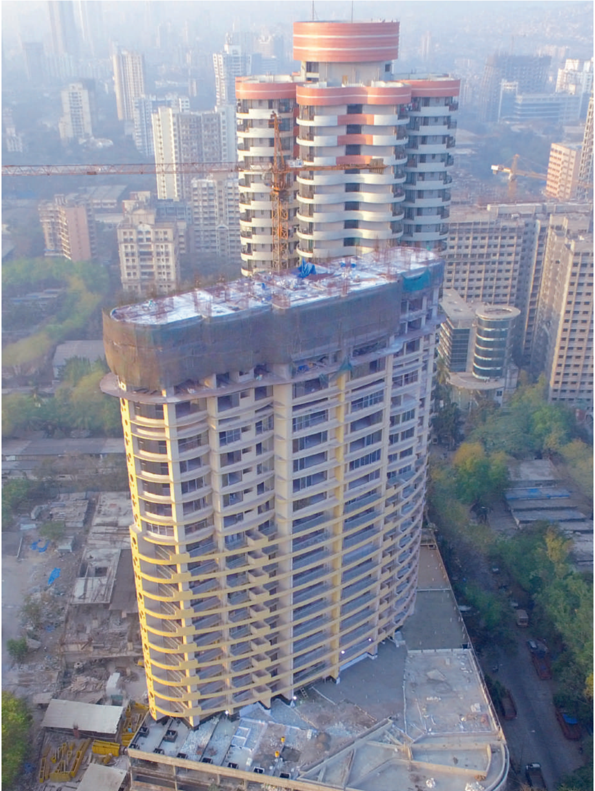
Actual Image - Site Construction Status: 32nd Slab Completed | OC received till 22nd Floor