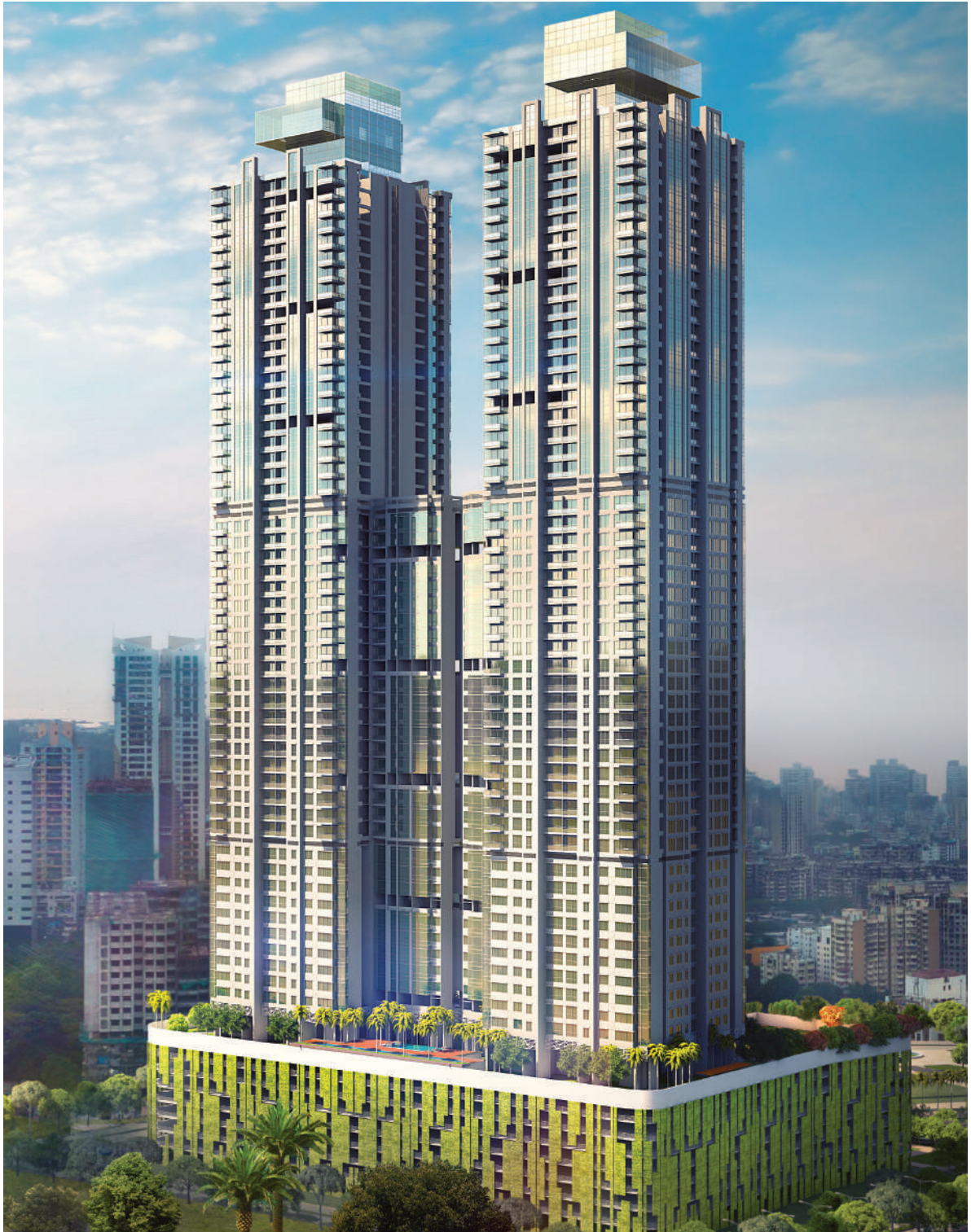
Artist's Impression - Elevation

RERA NO.: Monte South 1 - P51900001936, Monte South 2 - P51800001779, Monte South 3 - P51800001681, Monte South 4 - P51800001585 Monte South 5 - P51900001346, Monte South 6 - P51800002818