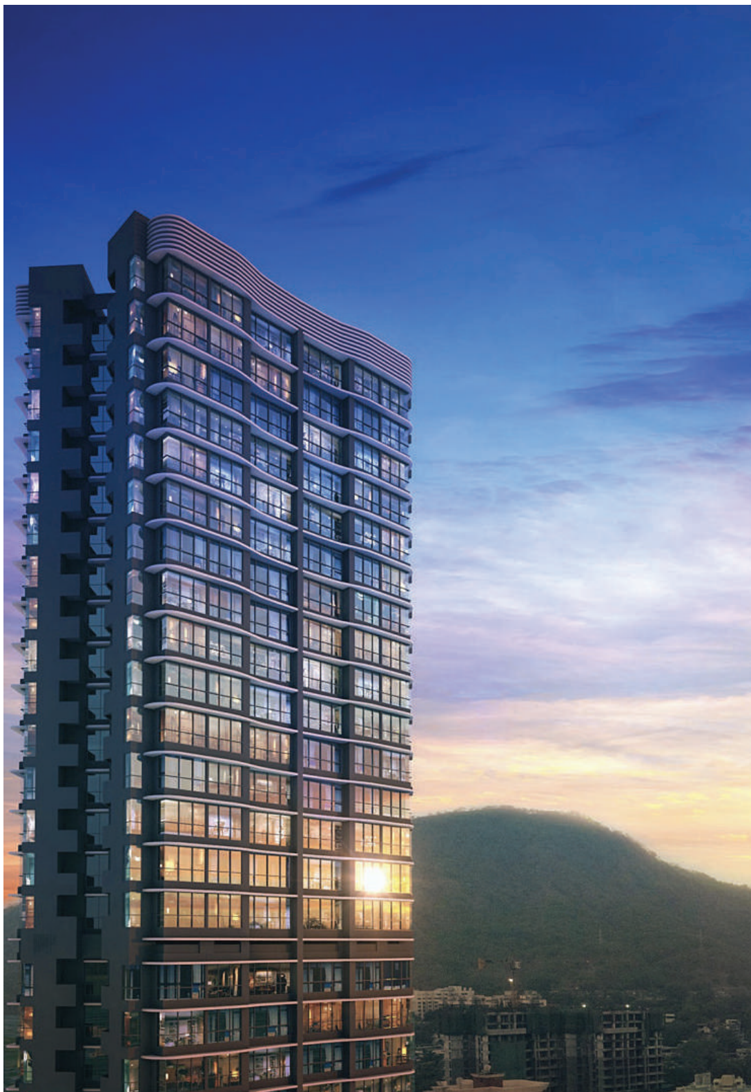
Artist's Impression - Elevation RERA NO.: Marathon Millenia - P51800017324 Newly Launched