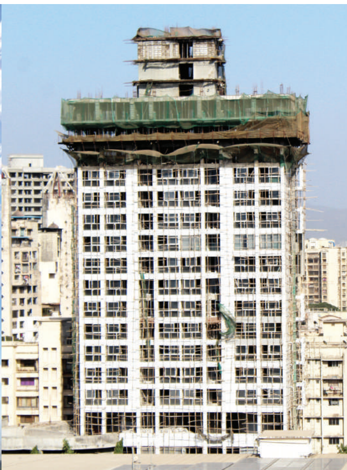
Actual Image - Site

RERA NO.: Marathon Emblem 1 - P51800000645, Marathon Emblem 2 - P51800000556