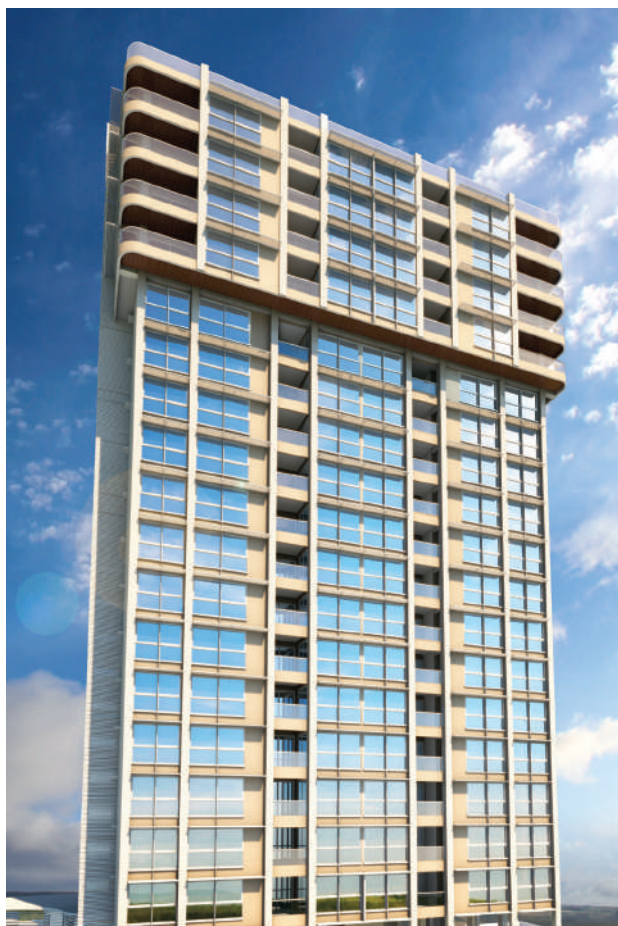
Artist's Impression - Elevation