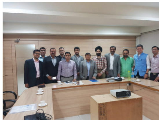
Meetings with State & Central GST Council.

3. GST - With regards to the GST, that came into force from July 2017; with the support of the CREDAI MCHI members, we have been able to bring down the GST on the affordable housing projects from 12 to 8%. We have also presented our findings and suggestions on the impact of GST on our customers with respect to ready, under construction and newly launched properties and are vigorously following up for the Center’s consideration on the same to help us in ease of doing business with GST.