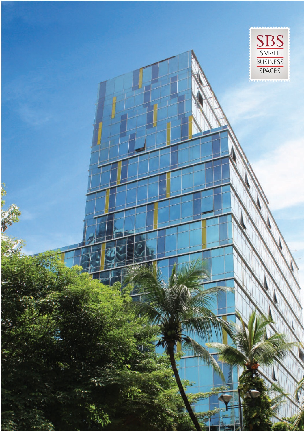
Actual Image - Elevation