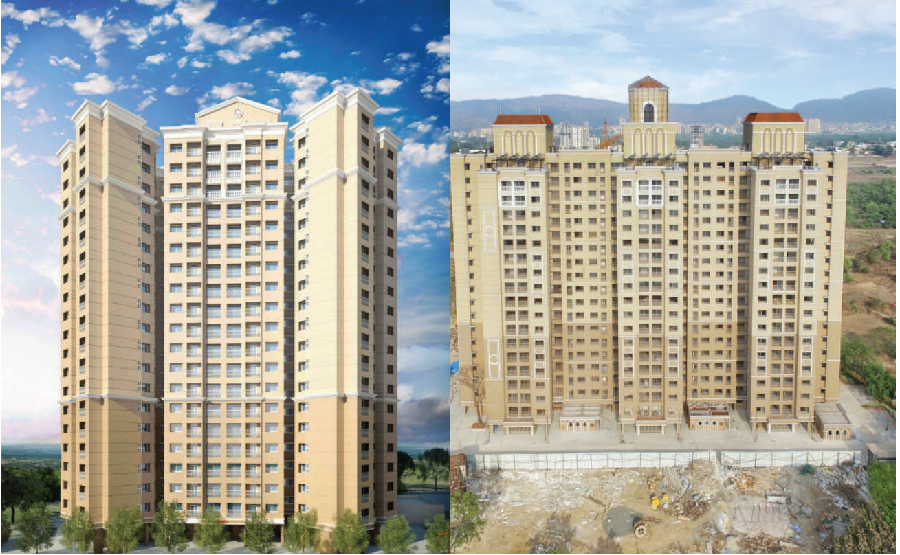
Artist's Impression - Elevation