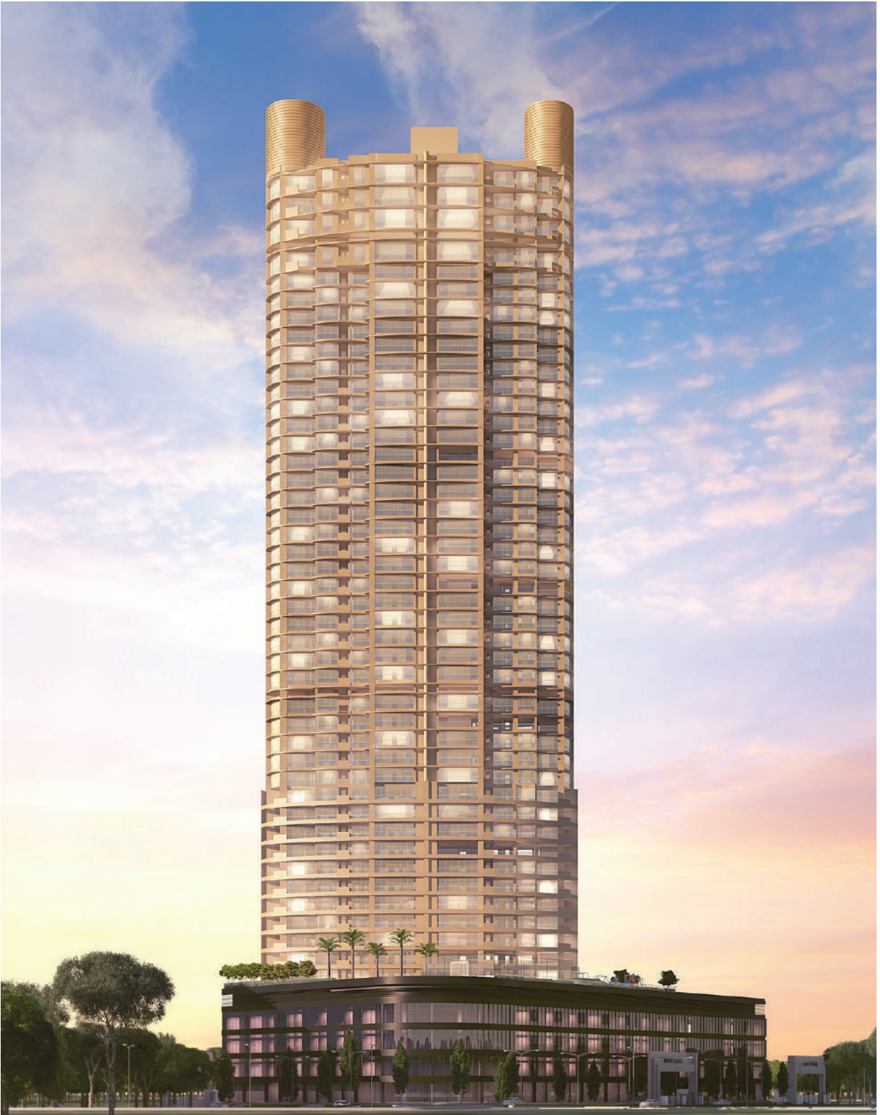
Artist's Impression - Elevation RERA NO.: Marathon Monte Carlo 2 - P51800002662