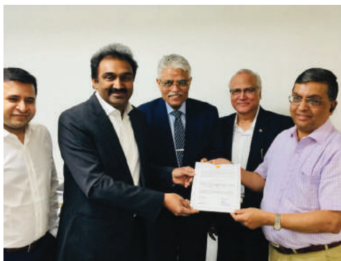
Magnetic Maharashtra Event

6. Golden Pillar Awards 2018 - This year also saw the launch of industry wide recognition event: Golden Pillars Awards 2018; where developers across MMR were recognized for their projects and important contributions to the business of real estate.