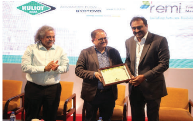
Workshops on DCPR 2034 with Developers fraternity