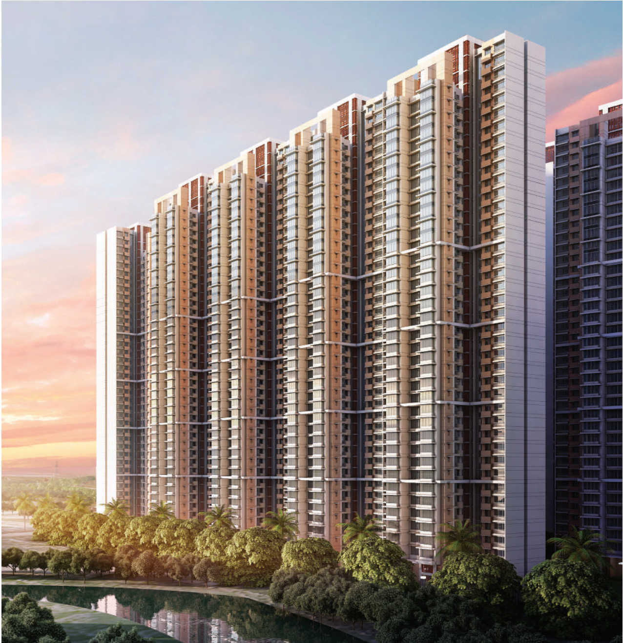
Artist's Impression - Elevation

RERA NO.: Marathon Nexzone Zodiac 1 - P52000000547, Marathon Nexzone Zodiac 2 - P52000000661, Marathon Nexzone Zenith 1 - P52000000658 Marathon Nexzone Zenith 2 - P52000000667, Marathon Nexzone Altis 1 - P52000000573, Marathon Nexzone Altis 2 - P52000000677, Marathon Nexzone Avior 1 - P52000000502, Marathon Nexzone Avior 2 - P52000000713, Marathon Nexzone Acrux 1 - P52000000670, Marathon Nexzone Acrux 2 - P52000001062, Marathon Nexzone Atria 1 - P52000001047, Marathon Nexzone Atria 2 - P52000000495, Marathon Nexzone Atlas 1 - P52000000662, Marathon Nexzone Atlas 2 - P52000000472, Marathon Nexzone Aura 1 - P52000000665, Marathon Nexzone Aura 2 - P52000000669, Marathon Nexzone Triton 1 - P52000000663, Marathon Nexzone Triton 2 - P52000000668, Marathon Nexzone Antilia 1 - P52000000666, Marathon Nexzone Antilia 2 - P52000000671, Marathon Nexzone Vega 1 - P52000000674, Marathon Nexzone Vega 2 - P52000000522, Marathon Nexzone Ion 1 - P52000000660, Marathon Nexzone Ion 2 - P52000000664