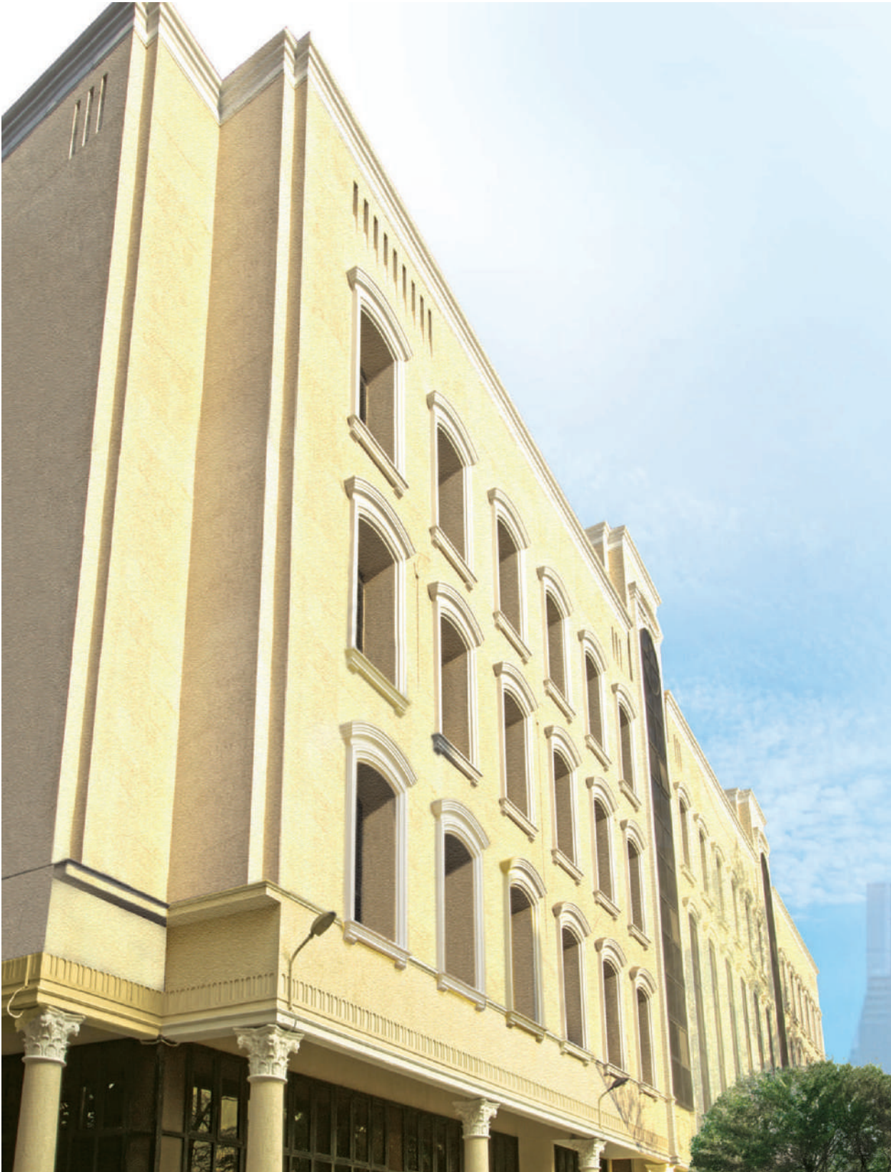
Actual Image - Elevation