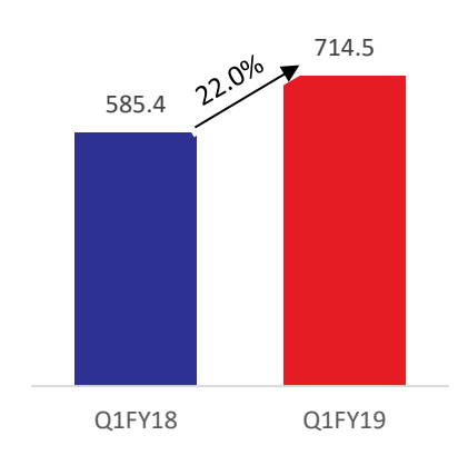
PAT (in Rs. Cr)