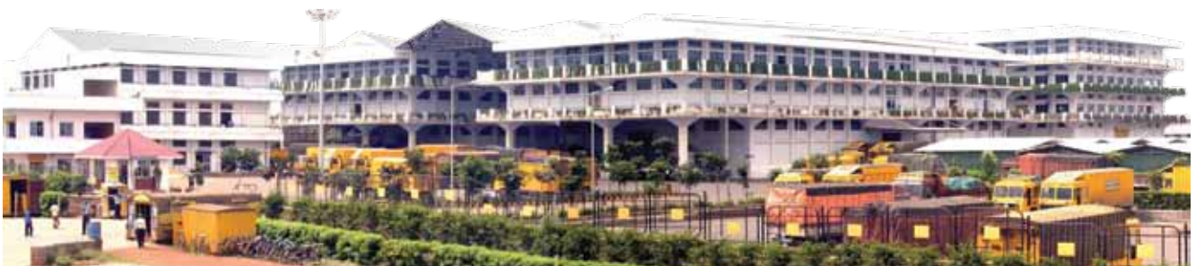
Hubballi Head Office

We are committed to provide quality logistics services consistently at reasonable price and to continuously improve the same to achieve customer delight on a sustained basis.