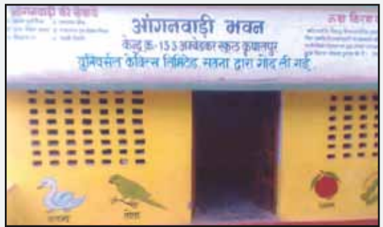
CSR activities during the year