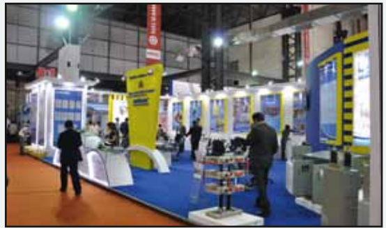
Company's products being showcased at IEEMA International Exhibition at Mumbai in January, 2012