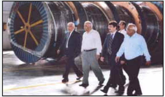
Glimpses of Chairman's visit to factory premises at Satna.