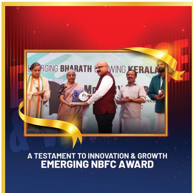
A TESTAMENT TO INNOVATION & GROWTH EMERGING NBFC AWARD