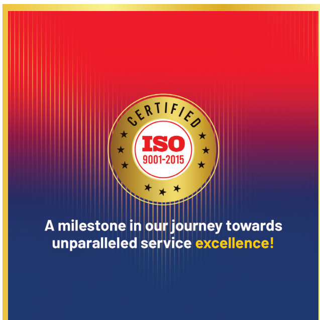
A milestone in our journey towards unparalleled service excellence!

We have also been recognised in Jwala 2024 Awards by Hon'ble Padmasree Bharath Mammooty.