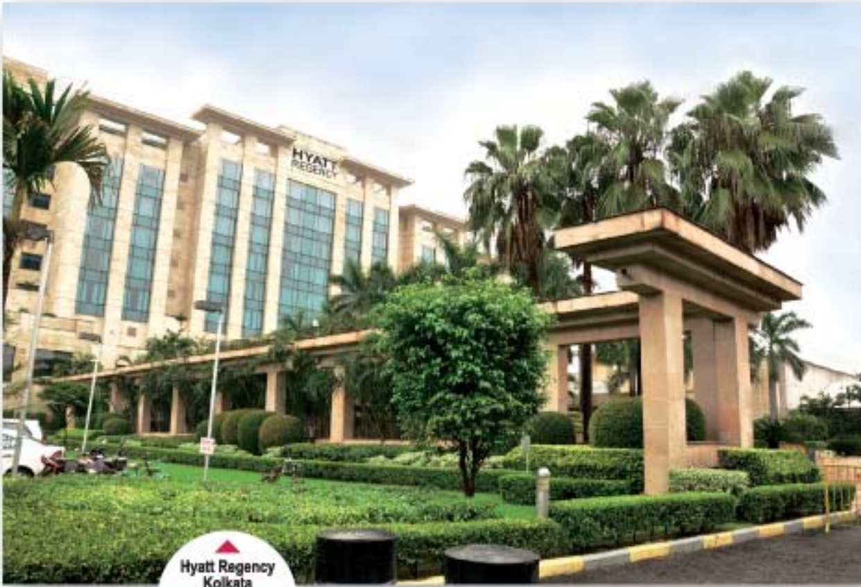
▲ Hyatt Regency Kolkata Hyatt Regency Chennai ▼