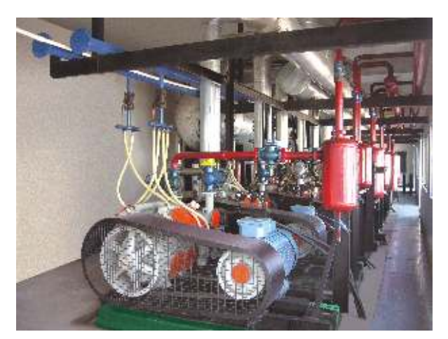
Refrigeration package for refinery process for Euro IV Fuel

Battery of KC KCX series compressors at EOU unit for food processing and preservation