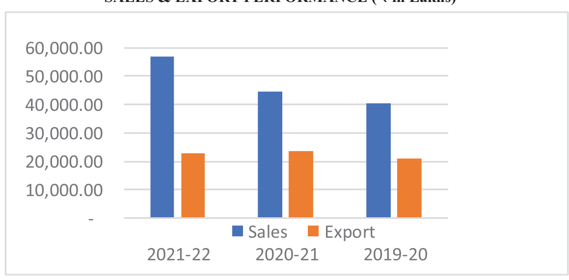
SALES & EXPORT PERFORMANCE (₹ in Lakhs)

During the year under review, the Total Revenue of the Company was ₹56808.31 Lakhs as compared to ₹ 44676.12 Lakhs. The Company's Profit after Tax stood at ₹ 2371.69 Lakhs as compared to ₹ 3270.59 Lakhs. The Chart depicts the export sale as compared to total sales of the Company over last 3 years.