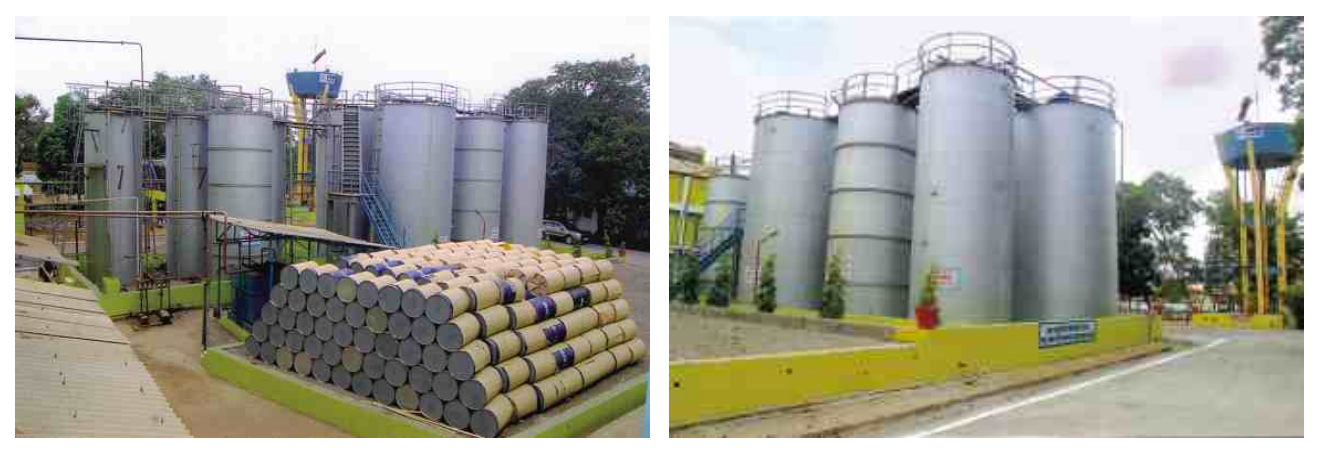
Raw Material Storage Facility