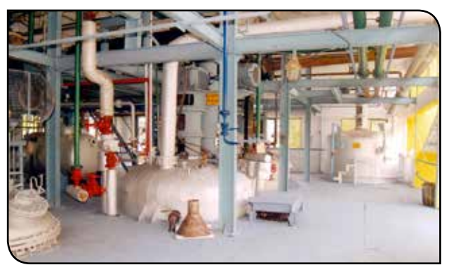
Resin Manufacturing Facility